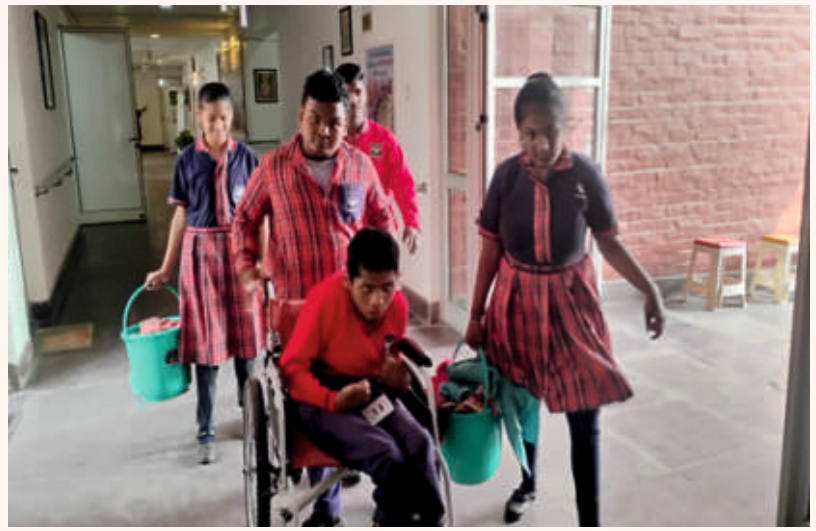
Students take great pleasure in garden work, i.e., compound cleaning, watering plants, and collecting fruits from the garden